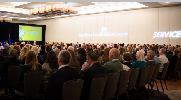
Indiana credit unions were well-represented at Convention 2022.