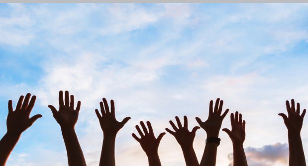
Thanks to contributions from individuals, credit unions, and vendors, the Indiana Credit Union Foundation funds a number of projects that benefit credit unions.