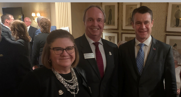
The League's advocacy efforts strengthen relationships between credit unions and Hoosier legislators. Representatives from the League and credit unions have met with legislators in Washington, D.C. as well as at home to discuss a variety of credit union issues.